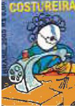
Fig. 2. Brazilian stamp.

on it (one of which most appropriately showed a very curly haired Costureira; see Figure 2). The letter was written in 20-pt font (mostly in caps) which included the very memorable line 'I AM A DEALER IN BRAZIL', a request for exclusivity and an intriguing question about whether the pills were for ETERNAL use.